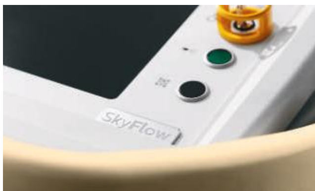
Usability Study Time Savings