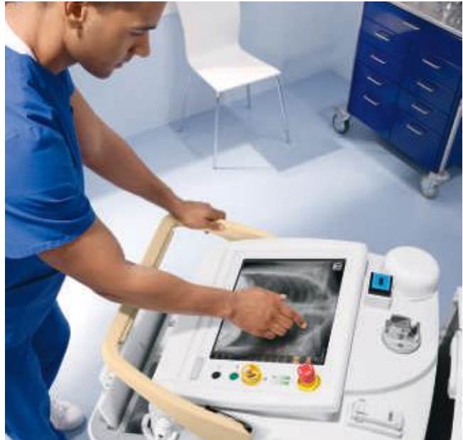
Bedside chest image acquired with SkyFlow