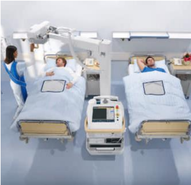
Bedside chest image acquired with a grid